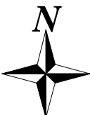
1 SITE PLAN 1 LOT 5 SCALE: 1" = 30'

COPYRIGHTED BY ALPINE DESIGN & INSPECTION, INC. THIS DRAWING IS NOT TO BE USED TO CONSTRUCT MORE THAN ONE BUILDING AT THE SITE LISTED OR ANY OTHER WITHOUT WRITTEN PERMISSION FROM THE COPYRIGHT HOLDER.